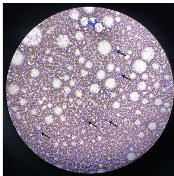
Figure 1 Bone marrow smear in case 7. Bone marrow cytomorphology showed hypercellularity and markedly increased megakaryocytes (black arrows) at low magnification (100 \times ).

parenchymal lesions including cerebral infarction, cerebral venous infarction, hemorrhagic cerebral venous infarction and cerebral hemorrhage. Meanwhile, MRV or DSA showed that all cases suffered from more than one sinus thrombosis. The most common sites of CVST were the sigmoid sinus and transverse sinus, followed by the superior sagittal sinus, jugular vein and straight sinus. Additionally, the cortical venous, confluence of sinuses and inferior sagittal sinus could also be involved occasionally. MRV appearances of case 7 see Figure 2 .