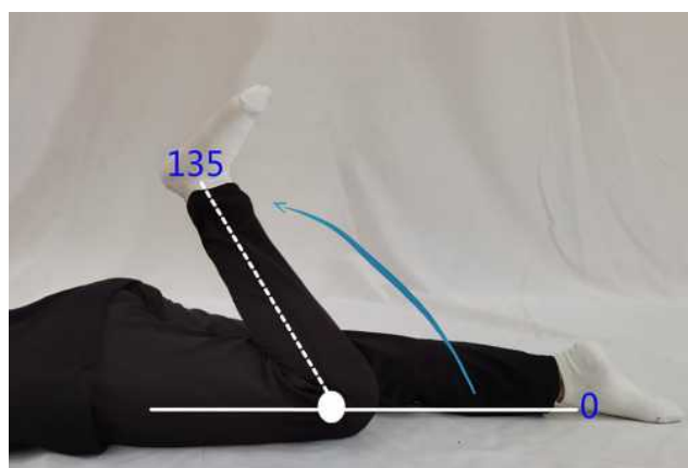
Figure 1 Knee joint flexion test chart.