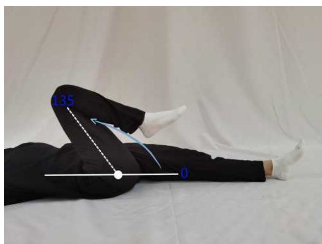
Figure 3 Hip flexion test chart.

and brings them close to the chest. We fix the goniometer axis at the femur's greater trochanter; the fixed arm was parallel to the ground; we place the movable arm along the middle of the femur. The Patient exerts the maximal effort of actively flex the hip and record the movement angle of hip flexion (0–135°, Figure 3).