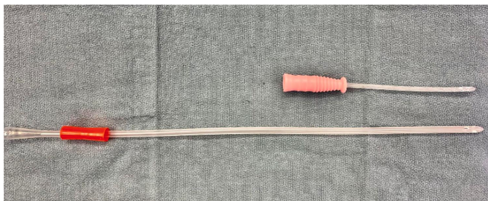
Figure 4 Urinary catheters for intermittent catheterization, 12 Fr female catheter (top) vs 12 Fr male catheter (bottom) representing anatomic difference in overall urethral length (Magic 3 GO Hydrophilic catheters, BARD).

are reflected in the difference in size of male and female catheters used in CIC (Figure 4).