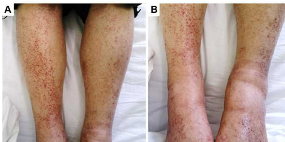
Figure 1 The photograph shows purpura on both legs. (A) Anterior view of the tibia. (B) Anterior view of the ankle.

IgAV is a systemic vasculitis with deposition of IgA-containing immune complexes. It involves small vessels with the manifestation of purpura on the limbs, abdominal symptoms, arthritis, and renal disorder. 1 IgAV occurs