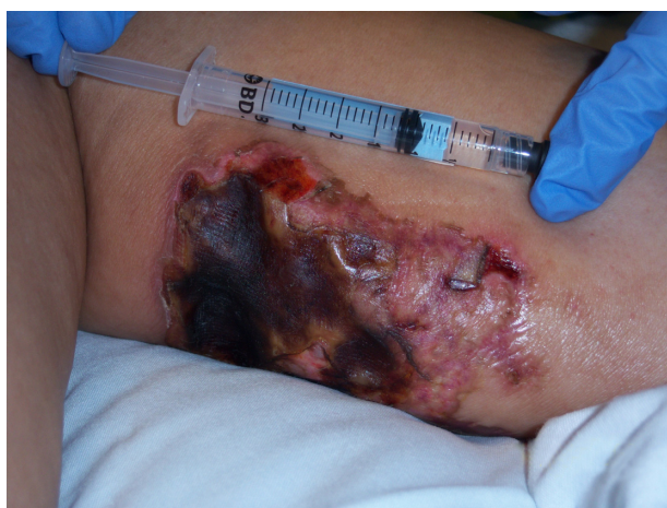
Figure 1 Third degree burn after PACU block.