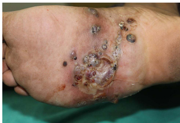
Figure 1 Classic triad of mycetoma with woody hard swelling, discharging sinuses and grains.

As the mycetoma involves mainly the skin and the subcutaneous tissue, the presentation is usually the classical triad of a painless, indurated subcutaneous mass giving a woody hard feel, multiple discharging sinuses, and presence of grains in the purulent or seropurulent discharge 6