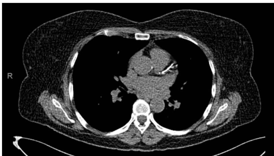
Figure 1 Coronary calcium scan showing diffuse severe coronary calcifications.

Case 2: Coincidentally, her sister was referred independently to the same clinic for uncontrolled hyperlipidemia. She was a 54-year-old female with hyperlipidemia diagnosed 20 years ago. A lipid panel showed a TC of 423 mg/dL, LDL-C of 292 mg/dL, HDL-C of 59 mg/dL and TG of 360 mg/dL. Lp(a) was mildly elevated at 46 mg/dL. There was no other relevant medical history other than mild obesity with body mass index of 31, and she had no