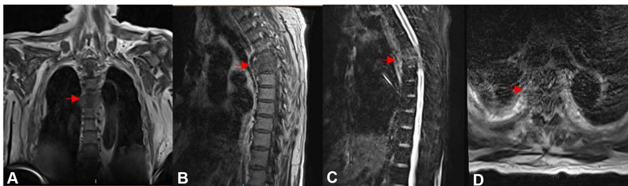
Figure 1 MRI of the thoracic spine. (A) Coronal view showed destruction of thoracic spine with pedicular involvement (arrow). (B) Sagittal view T1-weighted images showed wedging of 5th and 6th thoracic spine (arrow). (C) Sagittal view T2-weighted images showed a pathological intensity with increased signal on the 5th and 6th vertebral bodies (arrow) and extended to paravertebral region and compressed the spinal cord on that level (D).

A week after hospital admission, we performed a posterior stabilization with the pedicle screws and rods system on 4th, 5th, 7th and 8th thoracic spines and transpedicular biopsy on 6th vertebra (Figure 2). A 3 cc of purulent discharge was oozing out from the 6th thoracic body while performing the biopsy. Tissue samples for culture and pathological exam were obtained and macroscopically similar to granulation tissue from tuberculous infection. Debridement was further attempted. Decompression was achieved by laminectomy and flavectomy on the 5th and 6th thoracic level. A similar granulation tissue was found underneath the laminae and yellow ligament. Postoperatively, the patient was sent back to ICU for general health stabilization.