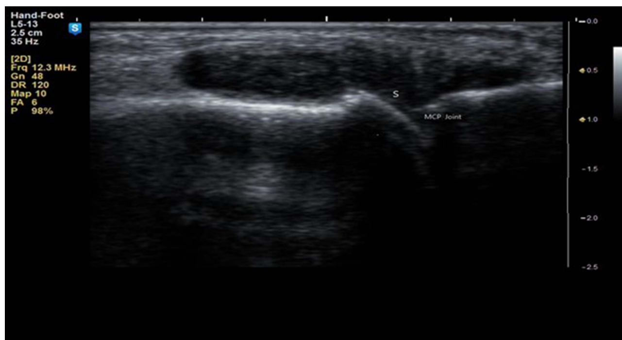
Figure 2 Gray-scale US long-axis view of MCP joint of right index finger of the same patient showing synovitis grade 3 (synovial hypertrophy and effusion).

Abbreviations: R, radius bone; L, lunate bone; C, capitate bone; S, synovitis.