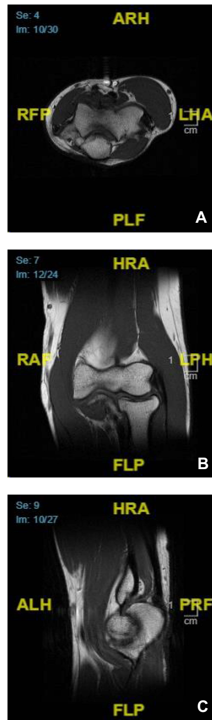
Figure 2 Right elbow MRI. No evidence of soft tissue mass or abnormal marrow signal: axial view (A), coronal view (B), and sagittal view (C).

The diagnostic value of immunohistochemistry in SS diagnosis is limited; however, a combination of EMA, BCL-2, and CD56 is commonly observed. CD99 staining may be positive in SS, and more recently TLE-1 immunohistochemistry has been used to help diagnose SS. Due to