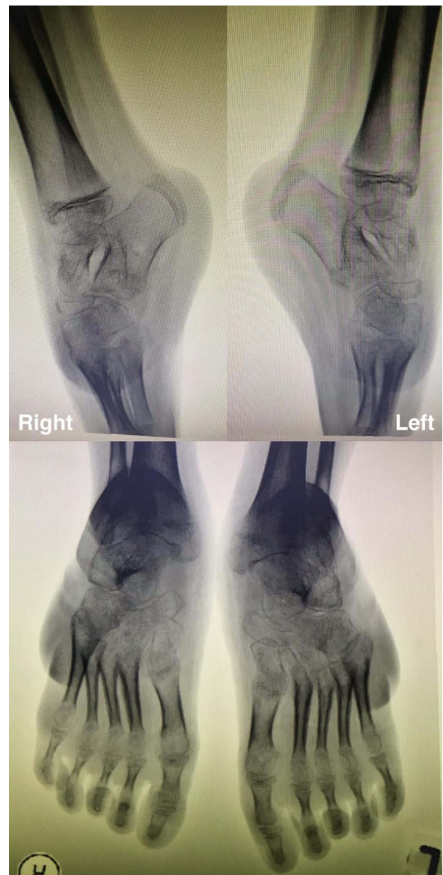
Figure 5 Repeat radiographs prior to posterior ankle release showing improved forefoot abduction.

Cast 1 and 2 were aimed at midfoot cavus correction with the forefeet casted in supination to align the hind-foot with the forefoot (2 weeks). We started forefoot abduction at cast 3 through cast 9 (7 weeks). We found we could achieve only few degrees of abduction within the patient's tolerance each week and the best final abduction at week 9 was at 30° with the head of talus satisfactorily covered and the heels in neutral (Figure 5).