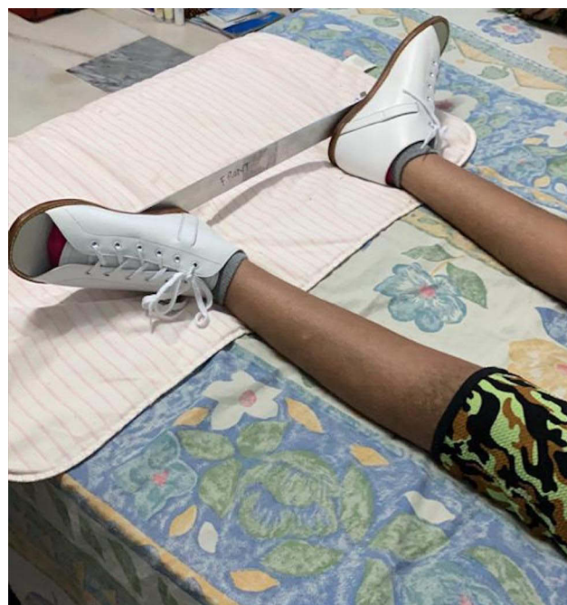
Figure 7 Foot abduction brace.

the conclusion of casting. We lost her to physical follow-up following her return to her country. By electronic communication with her carers, we discovered she was able to walk to school on uneven terrain (pebbled, mud path) six months after seeing us, and even participated in her school dance performance six months thereafter (Figures 8 and 9). At eighteen months post-treatment, she had picked up bicycle riding and was walking barefoot with no discomfort or pain in her feet and ankles, despite her radiographs (Figure 10).