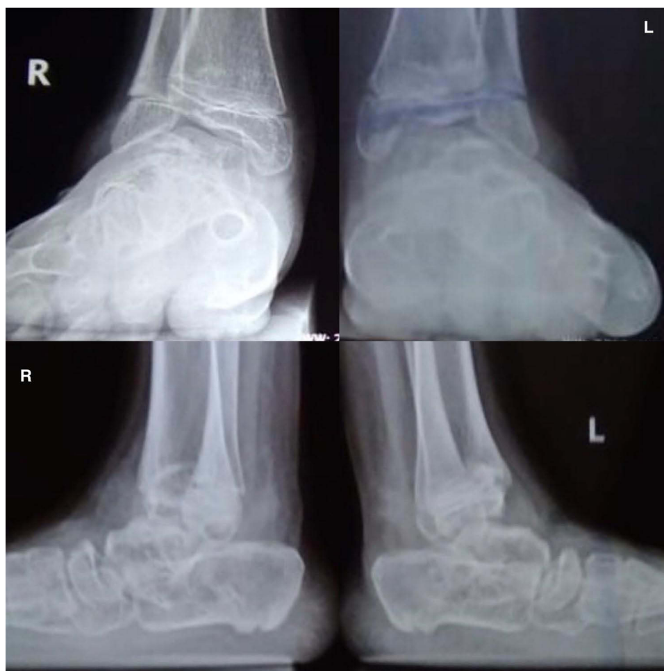
Figure 10 Weight-bearing views of both ankles at eighteen months with good function and painless ambulation.