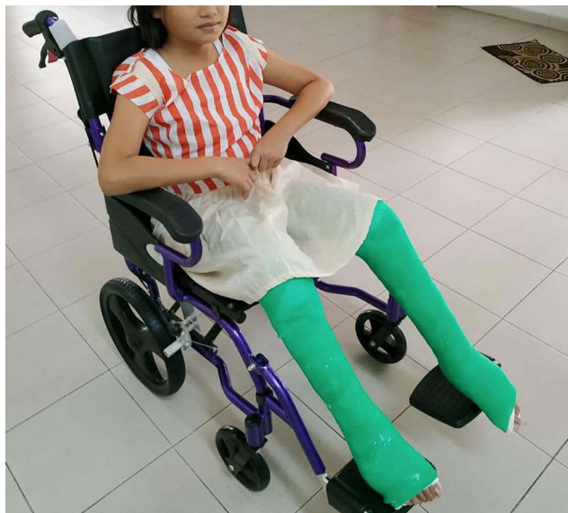
Figure 4 Long-leg bent-knee cast was convenient for wheelchair mobilization and car rides.

This outer water-resistant layer was added to the original Ponseti cast to cater to local and cultural setting.