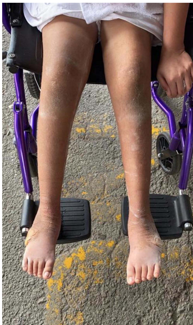
Figure 6 Alignment of the feet at the conclusion of casting showing marked improvement and dried callosity over the dorsolateral aspect.

We applied foot abduction brace (Figure 7) for night-time and recommended regular shoes in the day-time. She had painless range with 10° dorsiflexion, 45° plantar flexion with 20° inversion and 10° eversion at