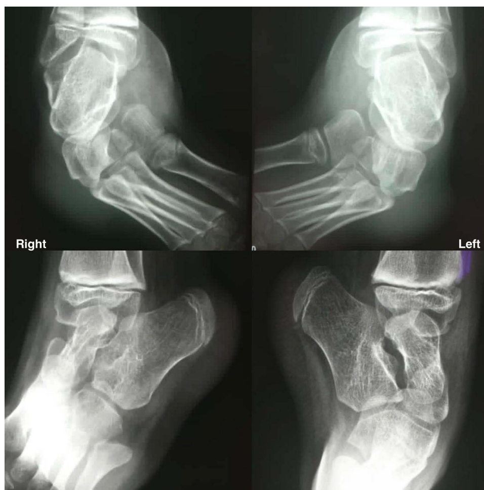
Figure 1 The patient's plain radiographs before treatment.