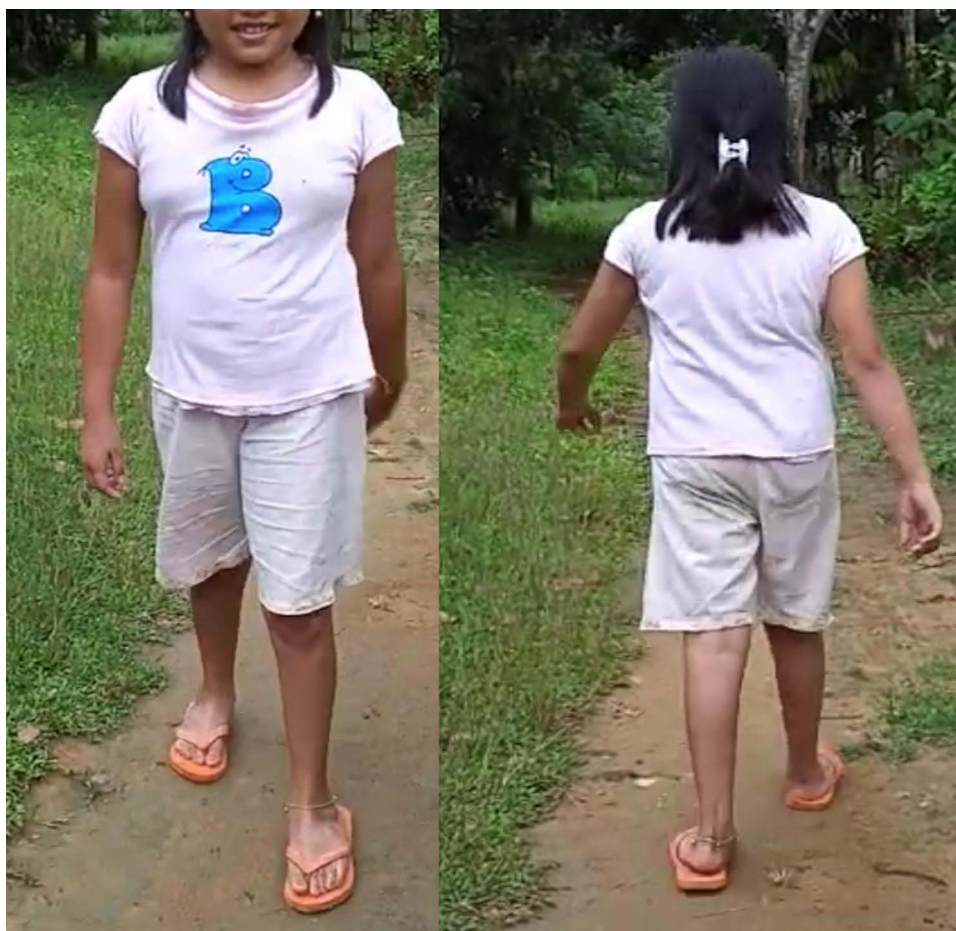
Figure 8 Twelve months post Ponseti treatment with independent walking on uneven earth terrain.

in older children is also more challenging to treat as the foot is less elastic. By definition, a child with clubfoot without treatment within the first two years of life is considered to have “neglected clubfoot”. 4