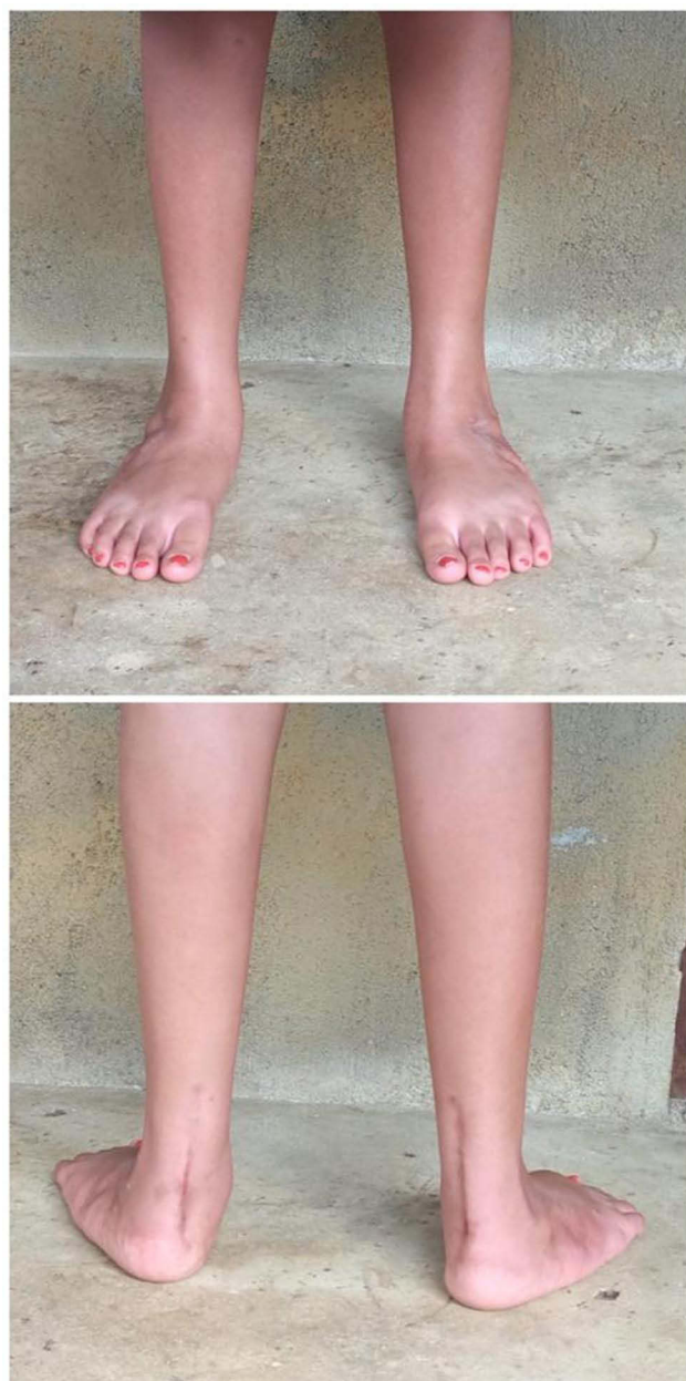
Figure 9 Near normal looking feet and no recurrence of clubfoot at twelve months; previous callosity had resolved with neutral to mild valgus heels.

release and posterior tibio-talar capsulotomy. We did not consider performing a prophylactic tibialis anterior tendon transfer at the time as the residual deformity was mainly equinus. This procedure was recommended to prevent relapses especially in children older than four years from distant regions with the risk of follow-up