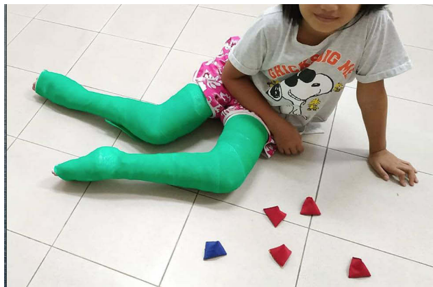
Figure 3 Sitting on the floor in long leg casts; she was able to move across the room despite the casts.

talus. Plaster of Paris was then applied over the foot to mid-leg, moulding was done in the corrected foot position of the week, the distal stockinette was then pulled over just until the tips of toes were seen, and the cast was allowed to set. The foot and distal tibia were then planted on the bed and positioned in external rotation with an assistant stabilizing the knee; the bolster was removed here, and the Plaster of Paris was completed to mid thigh with the knee in 45° flexion. This method of keeping the heel static on the bed holds the knee in constant flexion and allows smooth cast application without creasing the popliteal area. Following this, a roll of 4-inch fiberglass cast was applied for cast longevity, as we expected her to move for wheelchair transfers, and bottom shuffling on the floor (Figures 3 and 4).