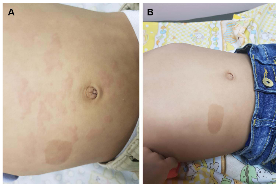
Figure 1 (A) Urticarial rash on the chest before treatment. (B) After treatment, the rash has disappeared.

Finally, he visited our hospital at the age of 6 years. He was febrile, and physical examination revealed red eye, urticarial rash, frontal bossing, hypertrophic tonsils, watch crystal nails and failure to thrive. Laboratory tests showed marked leukocytosis (between 17,000 and 25,000 per mm 3 ), anemia (Hb 8.7 mg/dL), a high C-protein reactive (CPR) and erythrocyte sedimentation rate (ESR), and no proteinuria or hematuria (urine); he was negative for anti-Smith, anti-DNA, and anti-RNP antibodies. PPD skin test was negative, and his thorax radiograph was normal. Serologies for Epstein Barr virus, Toxoplasmosis, Herpes virus I and II, Cytomegalovirus, HIV, Hepatitis B and C were negative. He was evaluated by ophthalmology, and corneal subepithelial infiltrates were found in both eyes as well as nummular keratitis.