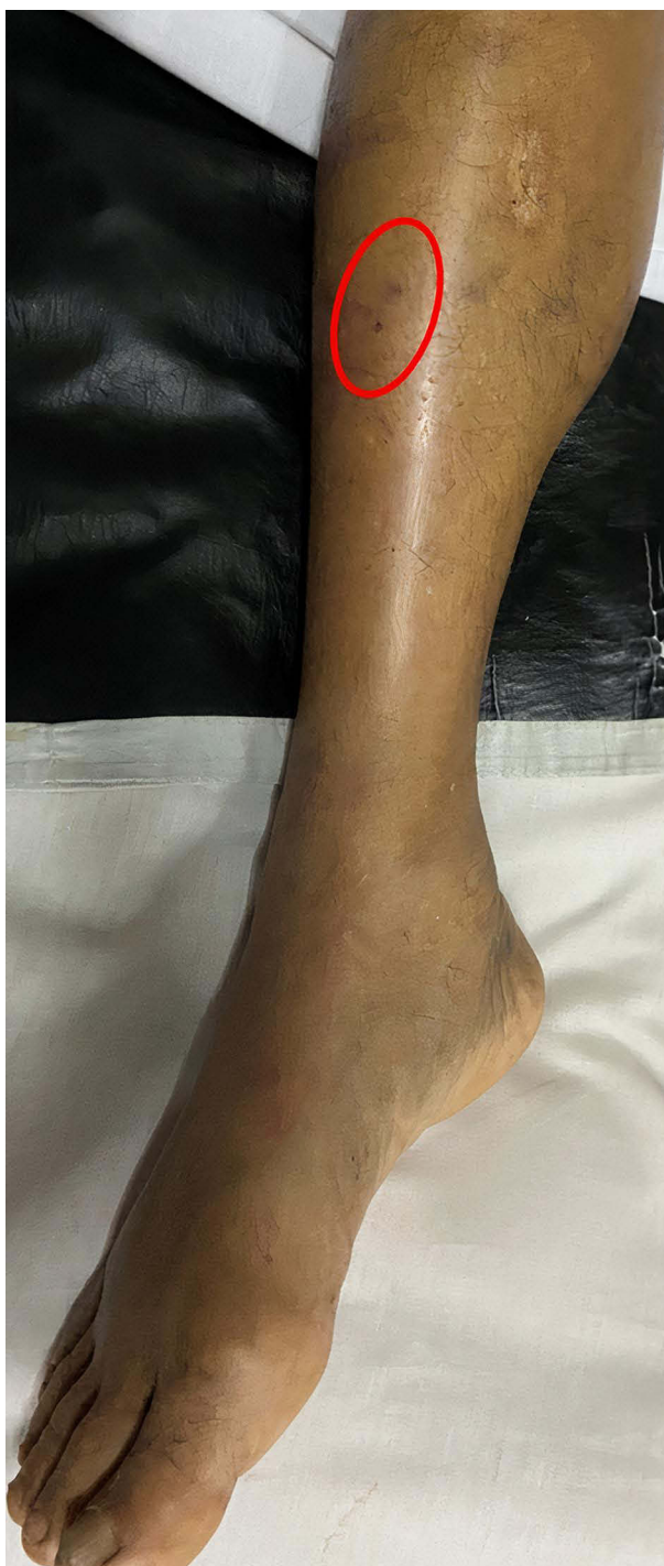
Figure 1 A swollen right leg with fang marks (fang marks were circled in red).

ceftriaxone one gram twice a day. The patient and patient's family had no history of hypertension, diabetes mellitus, or heart disease.