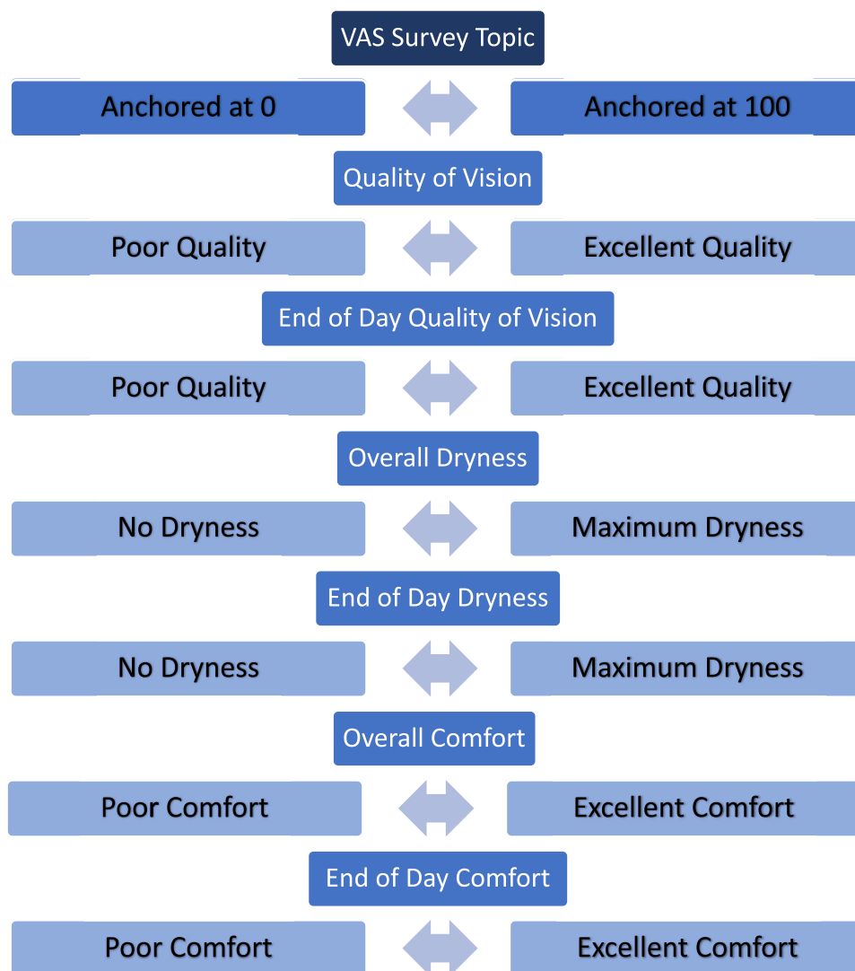
Figure 3 End of study visual analog scale (VAS) surveys presented and text describing each anchor, as presented to participants.

Contact lens related dryness was evaluated through with VAS surveys and the CLDEQ-8. Median (interquartile range) overall dryness was 28.50(49.00) and end of day dryness while wearing the contact lens was 30.50(64.25). CLDEQ-8 scores revealed a median (interquartile range) of 9.50(11.75).