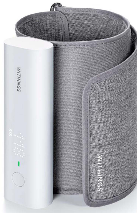
Figure 1 The Withings BPM Connect device.