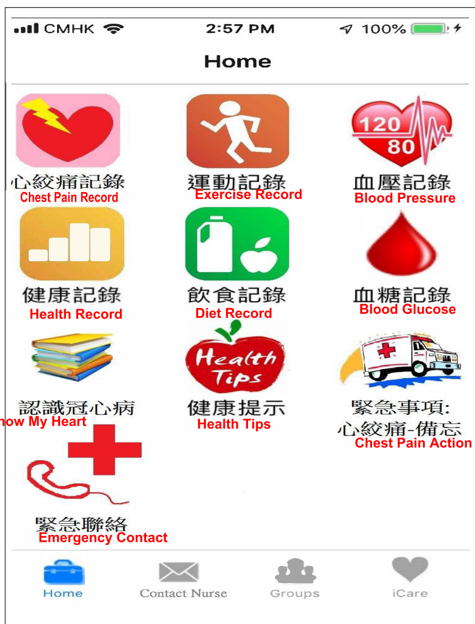
Figure 1 Front Page of the App.

to use the membership area of the app, as it was restricted to individual member with the first time log in and password with own's smart phone. To arouse interest in engagement in and fidelity to the app interaction by using their smart phone, the participants are encouraged to input own daily exercise time and type of exercise there. Weekly blood pressure input is also encouraged. If they forget to input their exercise daily with their smart phone, they can input it back within one week. An alert/feedback message in red was provided if the self-inputted health data, such as blood pressure, were found to be abnormal or they did not perform exercise for 2 weeks. In addition, two automatic messages (randomly generated from a pool of fifteen automatic messages) with encouraging words to sustain their exercise maintenance were provided weekly to all participants. Furthermore, the participants could easily read their health and exercise records, with trends shown in line charts. In summary, the app could help alert patients to their CHD risks (chest pain episodes, blood pressure) and provide support for their efforts to monitor their health and keep exercise records.