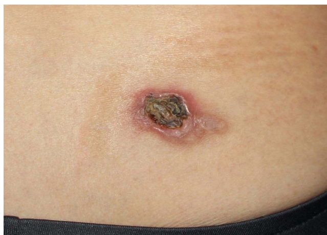
Figure 1 An ulcerated red lesion with peripheral erythema on the waist.

size, and the center of the lesion developed an ulcer a few months later, which prompted the patient to seek medical attention in our hospital. Grossly, the lesion measured 47mm × 41mm in size, with an ulceration of 23mm × 18mm in the center, and the surrounding skin demonstrated irregular pale red erythema (Figure 1).