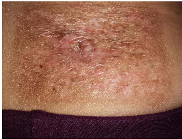
Figure 3 After radiotherapy, the lesion showed a clear border and the central ulcer healed, surrounded by radiation dermatitis.

Laboratory examination demonstrated anemia and lymphopenia with a decreasing absolute lymphocyte count (ALC) of 0.54 \times 10^9/L . Computed tomography (CT) scan of the chest, abdomen, and pelvis did not show any evidence of systemic involvement by lymphoma.