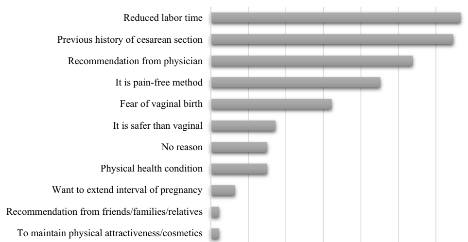
Figure 3 Reasons for choosing cesarean section delivery.

On the other hand, data pertaining to respondents' reasons for choosing cesarean section delivery reveal that reduced labor time (33.3%), previous history of cesarean section (32.3%), recommendation from a physician (26.9%), the fact that it is a pain free method (22.6%), fear of pain in vaginal birth (16.1%), the belief that it is safer than vaginal mode of delivery (8.6%), and physical health conditions (7.5%) were the common reasons, as shown in Figure 3.