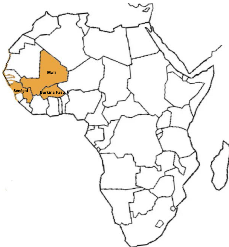
Figure 2 Three countries accounting for more than 80% of the SMC studies in West Africa.

Abbreviations: SMC, Seasonal Malaria Chemoprevention; IPTc, Intermittent Preventive Treatment in Children.