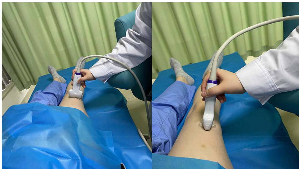
Figure 1 The position of probe and the placement of operator's arm.

Statistical analysis was performed with SPSS 25.0 software (IBM, United States). Data normality testing was inspected by Shapiro–Wilk. Measurement that conforms to the normal distribution is represented by x \pm s , and were compared by the independent sample t -test. Non-normally distributed measurement data are represented by medians and interquartile ranges and were compared by the rank sum test. Numerical data are represented by rates; and compared by the \chi^2 test.