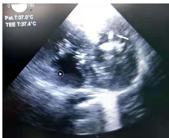
Figure 1 A medium echoic mass revealed by echocardiography.

Note: The white arrow shows large polypoid vegetations in the posterior leaflet of the mitral valve due to Corynebacterium infection.