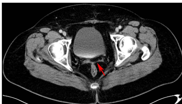
Figure 4 Target lesions at the end of the 11th cycle. Target lesions at the vaginal stump and in front of rectum reduced to 3.9 mm in longest diameter at the end of the 11th cycle (red arrow), which sharply decreased by 91.14%.

At baseline, the patient's CA125 level was 33.35 U/mL. After the 2nd cycle of treatment, CA125 level decreased to 4.78 U/mL, and was within the normal range on subsequent visits. Moreover, the patient underwent genetic testing and additional immunohistochemical tests during treatment of triplet combination. Genetic testing revealed BRCA1 (+), which was performed on September 22, 2021. Immunohistochemistry indicated PD-L1 (SP263), TC < 1%, CPS: 2, MLH1 (>90%), MSH2 (>90%), MSH6 (>90%), and PMS2 (>90%), which was performed on October 10, 2021.