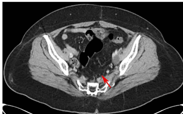
Figure 3 Non-target lesions at the end of the 4th cycle. Non-target lesions disappeared at the end of the 4th cycle of treatment and did not recur (red arrow).

accompanied by fatigue, weight gain, ECG ST-T changes, and other symptoms. The patient was given regular oral administration of levothyroxine sodium tablets (75ug QD) till now. Related symptoms were gradually relieved with good control. Reexamination of thyroid function was within the normal range. Another adverse reaction was a grade I red blood cell count decreased, which was fluctuating between 3.38 \times 10^{12}/L and 3.8 \times 10^{12}/L . The patient had no subjective symptoms and did not require clinical intervention. The hemoglobin, white blood cell count, and neutrophil count were within the normal range. The above adverse reactions were considered related to anti-PD-1 antibody and PARP inhibitor drugs, rather than the new adverse reactions due to the triplet combination therapy.