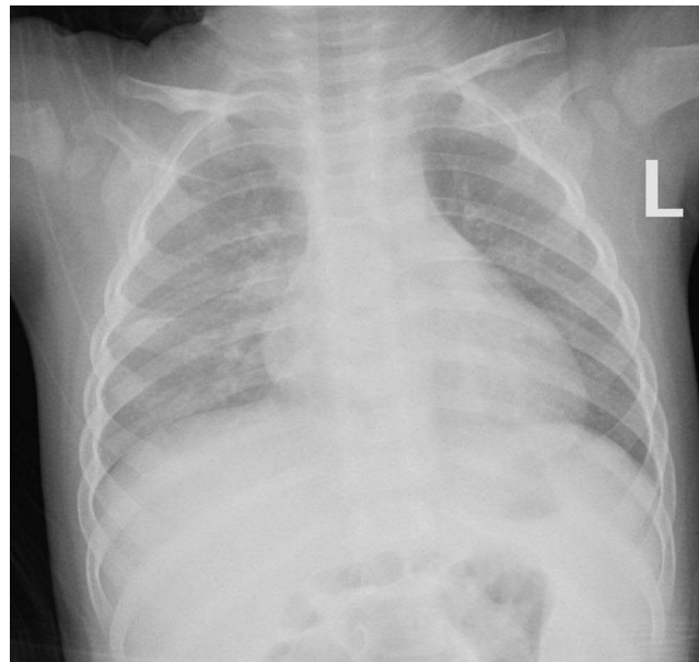
Figure 3 This chest X-ray showed bronchopneumonia, which was significantly better than the previous X-ray.