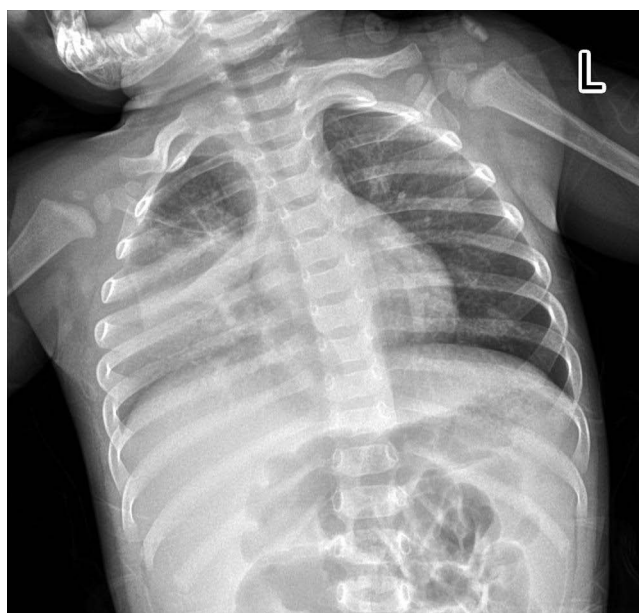
Figure 1 The girls' chest Xray showed pneumonia on the side.