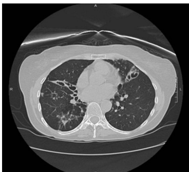
Figure 2 Cavitary bronchiectatic changes in a 65-year-old woman with MAC pulmonary infection.