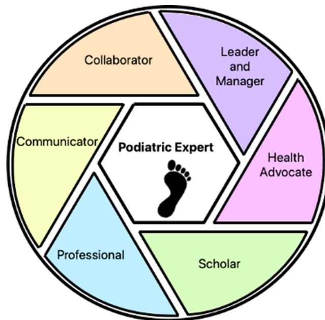
Figure 2 Diagram representing the 7 roles of our podiatric medicine competency framework.

Podiatrists are primary health professionals. They must collaborate effectively with other health professionals in an effective way to provide appropriated quality care satisfying the patient’s needs. This may be accomplished by referring