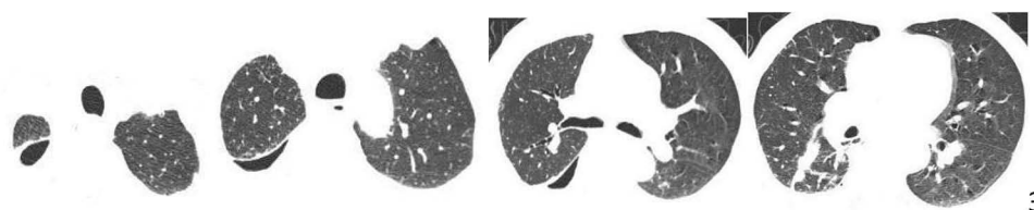
Figure 3 Chest CT at discharge showing that the right pleural effusion and pneumothorax were markedly absorbed.

Ultrasound examination of the pleural fluid showed that the right pleural fluid was separated. Multiple intrapleural injections of urokinase were administered.