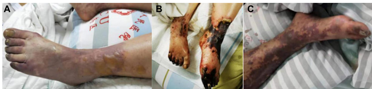
Figure 2 Cutaneous circumscribed ecchymosis and formation of bullae in Patient No.1 (A); gangrene in both lower extremities in Patient No.1 (B); extravasation of blood in the center of petechial lesions and enlargement of ecchymosis in Patient No.3 (C).

We believe that these results will contribute to better understanding of severe R.japonica infection. Definitive treatment should be instituted on the basis of clinical and epidemiological clues as early as possible to avoid severe disease and poor outcome.