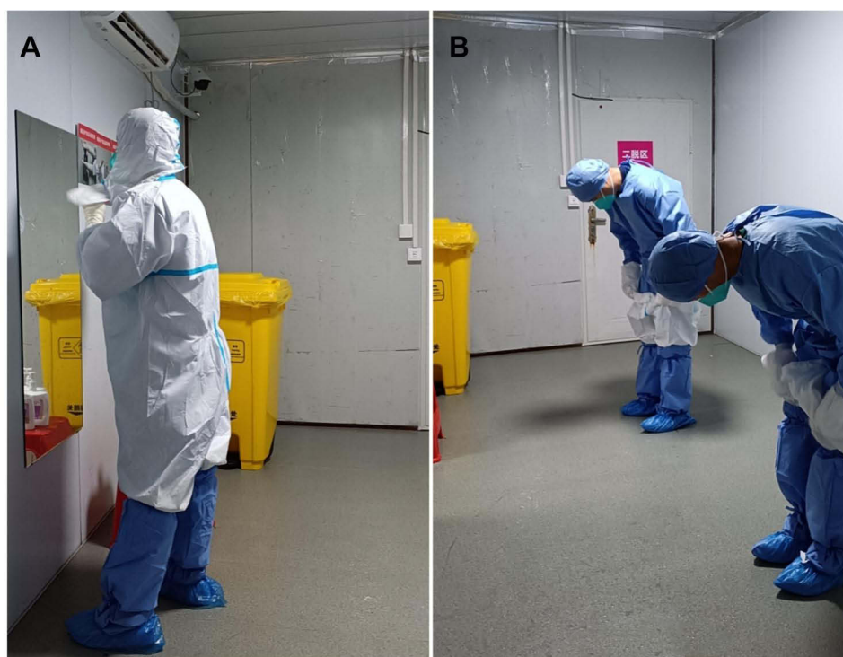
Figure 1 The third-party personnel take off the protective clothing. (A) Using the traditional supervision and management methods; (B) Using the new supervision and management methods.