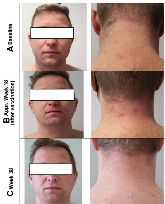
Figure 1 Photographs of a patient with moderate-to-severe atopic dermatitis treated for 38 weeks with tralokinumab ( A ). Baseline; ( B ) After approximately 18 weeks (following a vaccination for COVID-19); ( C ) Week 38 (end-of-study).

During tralokinumab treatment, the patient achieved stable disease and a reduction of the eye symptoms during follow-up. Improvement was observed in most measures of disease severity after 12 weeks of treatment ( Table 1 ). Follow-up visits at weeks 32 and 34 showed that disease measure scores were either maintained or further improved during continued treatment. The last follow-up visit took place at week 38, and tralokinumab continued to sustain clinical benefit during long-term treatment. The evolution of AD symptom and QoL scores from baseline to week 38 are shown in Figure 2 . Major improvements associated with tralokinumab therapy were reported for skin lesions (EASI, IGA), pruritus (itch) and other patient-related outcomes ( Table 1 ). EASI was reduced by 75.5% by week 38 vs baseline and