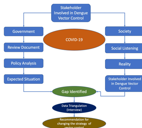
Figure 2 The developed framework used during the research.

center and health office, who was responsible for vector control in society and bridged communication to the health office related to proper dengue intervention in a particular area.