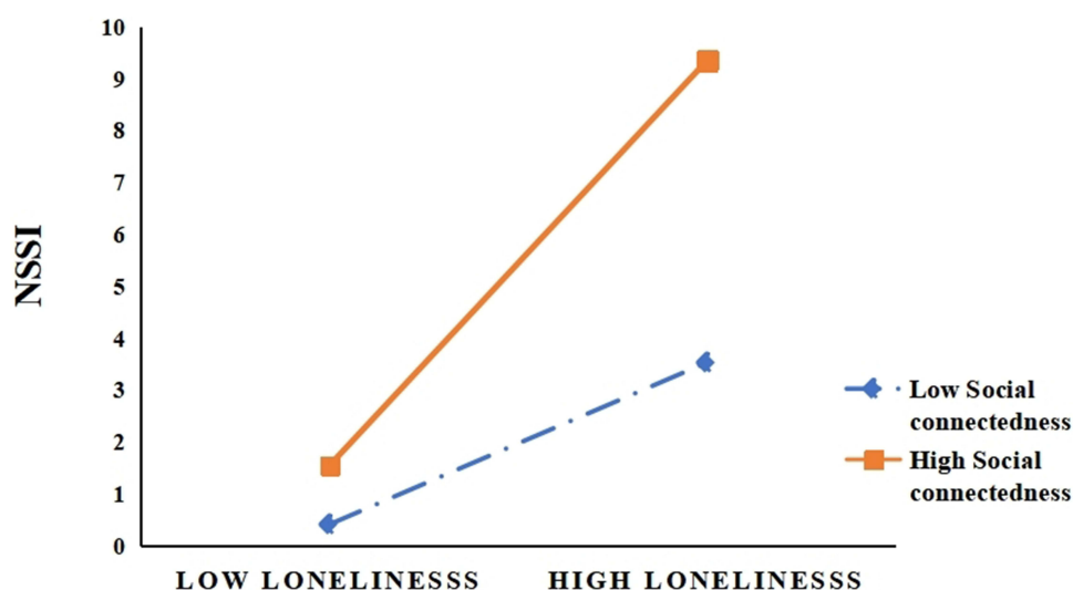
Figure 2 Moderating effect of Social connectedness on Loneliness and NSSI.

Both the results of this study and previous research experience exhibit that loneliness is significantly related to self-control, and self-control is also significantly related to NSSI. 27,33 In addition, self-control played a significant mediating role between