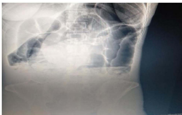
Figure 1 Distended large bowel segments and distal small bowel with visible fecal matter.