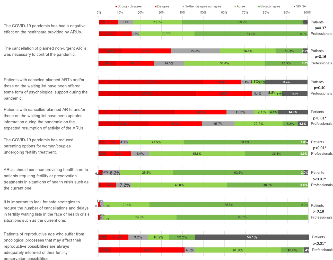
Figure 3 Answers to ad-hoc questionnaire by patients and professionals in arus on the impact of the pandemic on art service management (*p-value<0.05).