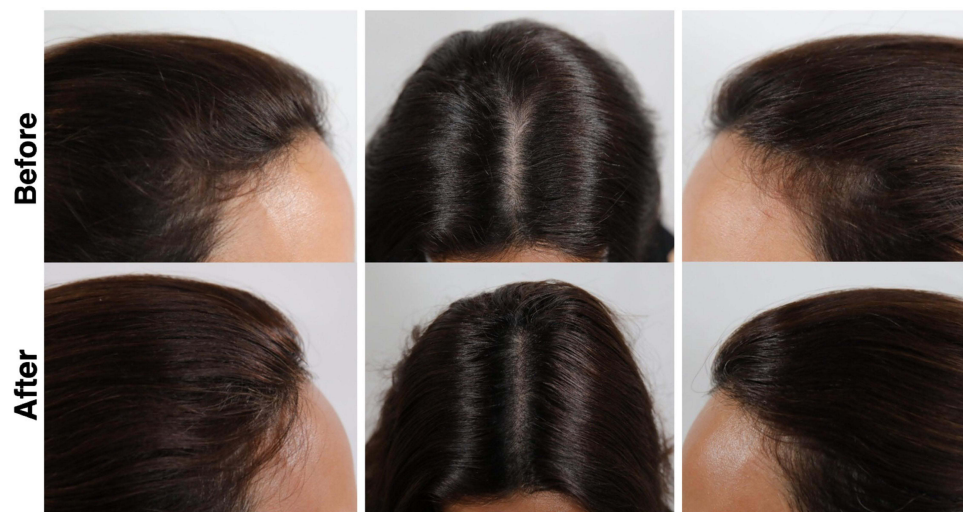
Figure 2 Pre- and post ADSC-CM clinical photography of a 39-year-old female patient showing an aesthetic improvement of the midline and bitemporal areas. The figures have been used with written consent of the patient.