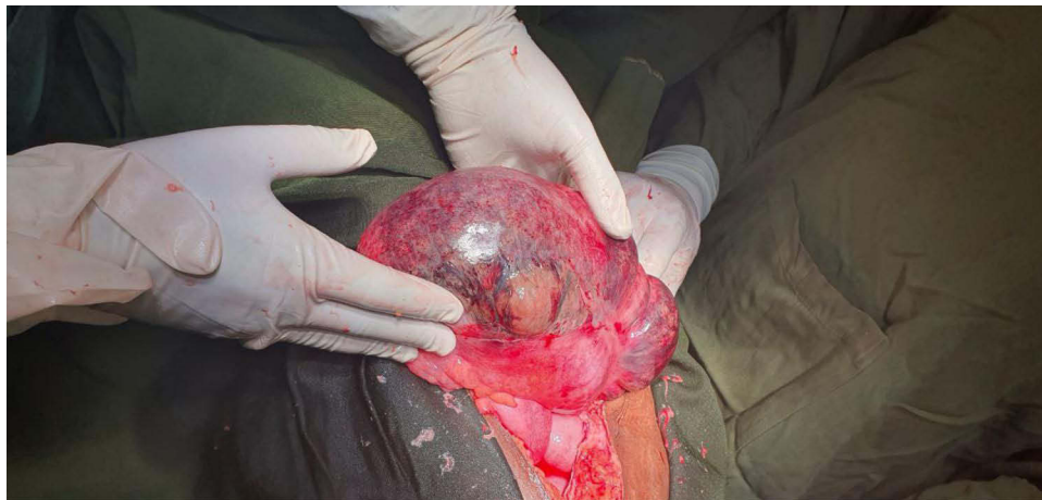
Figure 3 Axial twist of cecum along with its mesentery resulting in dilation, ischemia and necrosis of its anti-mesenteric surface.

obstructive pattern and persistent pain with intraoperative findings of ischemic and gangrenous distended cecum with early vascular compromise is consistent with other studies.