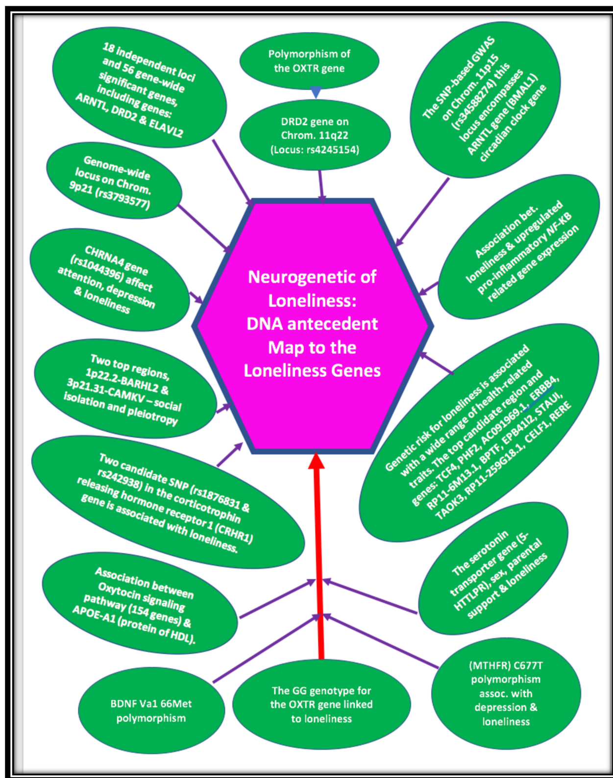
Figure 2 A schematic showing a proposed DNA antecedent map to the loneliness construct.

Clusters of individuals who engage in drinking or abstaining behavior were found within the network, and these clusters extended up to three degrees of separation. 148 These clusters were not solely a result of selective social ties among drinkers but also indicated interpersonal influence. Changes in alcohol consumption of a person's social network (eg, relatives and friends),