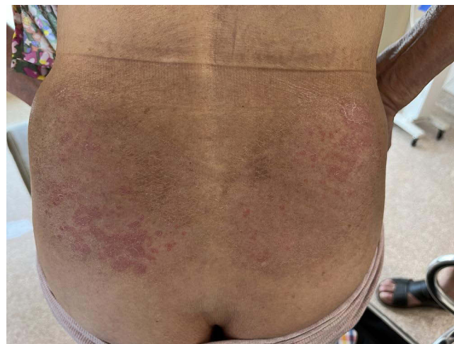
Figure 4 Topical calcipotriol and betamethasone ointment was applied to the psoriasis-like lesions.