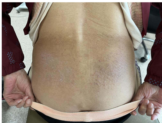
Figure 1 Erythema, papules, scales and excoriation on the waist.