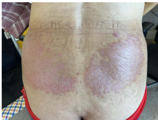
Figure 2 Psoriasis-like lesions: demarcated scaly erythematous lesions.

histopathology revealed psoriasiform acanthosis with a diminished granular layer and lymphocyte infiltration in the superficial dermis, suggesting the development of dupilumab-induced psoriasiform dermatitis (Figure 3). Initially, we discontinued dupilumab and applied topical calcipotriol and betamethasone ointment to the psoriasis-like lesions. This local treatment improved the skin lesions (Figure 4), but the pruritus remained significant, affecting her sleep. Due to the beneficial effect of calcipotriol/betamethasone, we decided to reintroduce dupilumab for continuous treatment. This patient's psoriasiform rash did not recur during the four months of following-up.