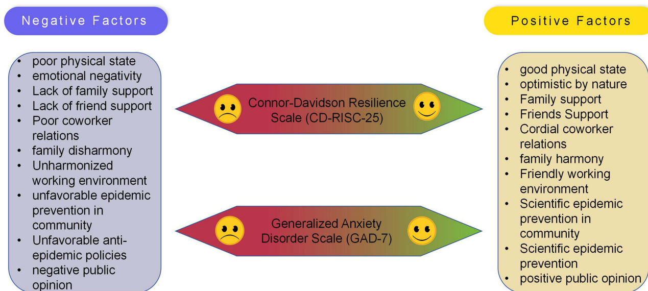
Figure 2 The connections between anxiety, resilience and negative or positive factors.

Our findings show that in the early stage of the outbreak, people's panic and anxiety mainly came from the unknown of the virus and the worry about their health status. In the middle stage of the outbreak, with the introduction of a series of anti-epidemic and anti-disease policies by the governments of various countries, the spread of the virus was effectively controlled, and the public's mindset gradually stabilized. As a result, they were full of confidence in overcoming the virus. In the late stage of the outbreak, people were no longer anxious about the outbreak itself, but more anxious and helpless because of the lack of supplies, stagnation of work, and economic recession brought about by the large-scale quarantine. Our findings were consistent with previous studies. In the meta-analysis by Wu et al, the risk of anxiety and depression for those who had experienced a blockade or quarantine was 1.38 and 1.74 times higher than that of those who had not experienced a blockade or quarantine. 9 During the COVID-19 pandemic, the risk of anxiety and depression was higher in the quarantined population than in the general population. Cheng's findings also suggest that the prevalence of anxiety or depression was higher in the quarantined population during the SARS epidemic. 1