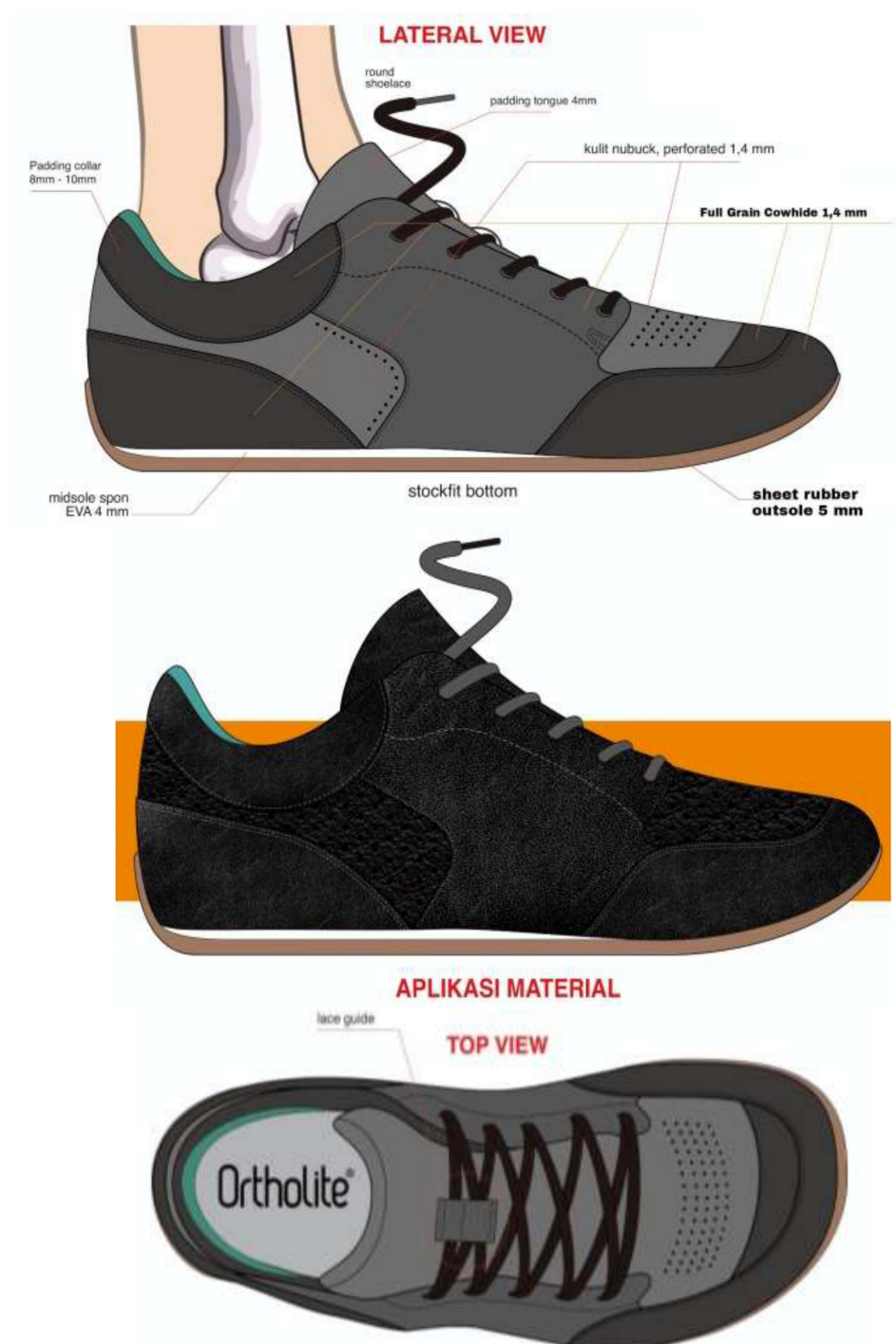
Figure 2 Individual anthropometry shoe design.