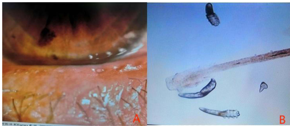
Figure 2 Ocular Mite Examination Results.

Notes: (A) Lid Margin Diffuse Light Photography; (B) Live Demodex Observation under 10x Optical Microscope.