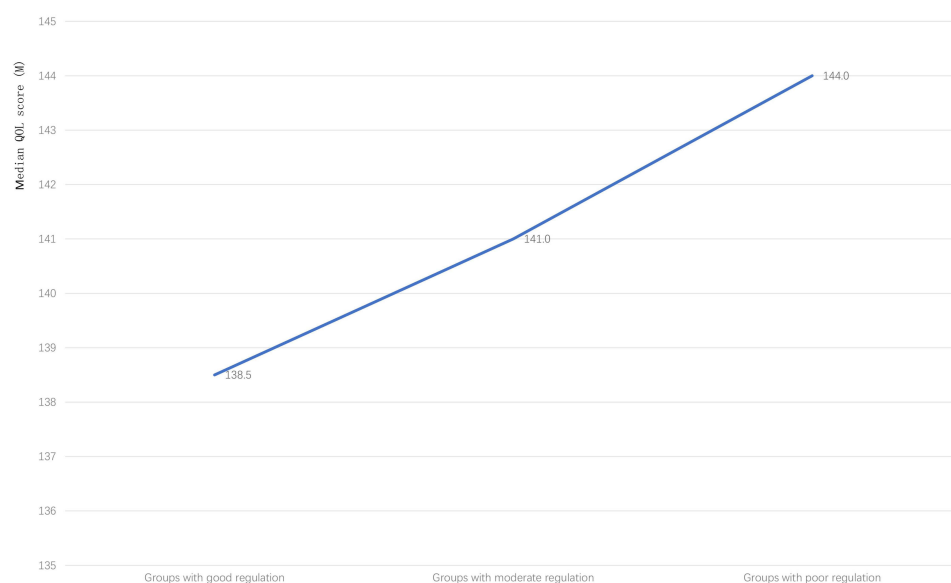
Figure 2 Median QOL score of children diagnosed with T1DM in groups based on of plasma glucose regulation.