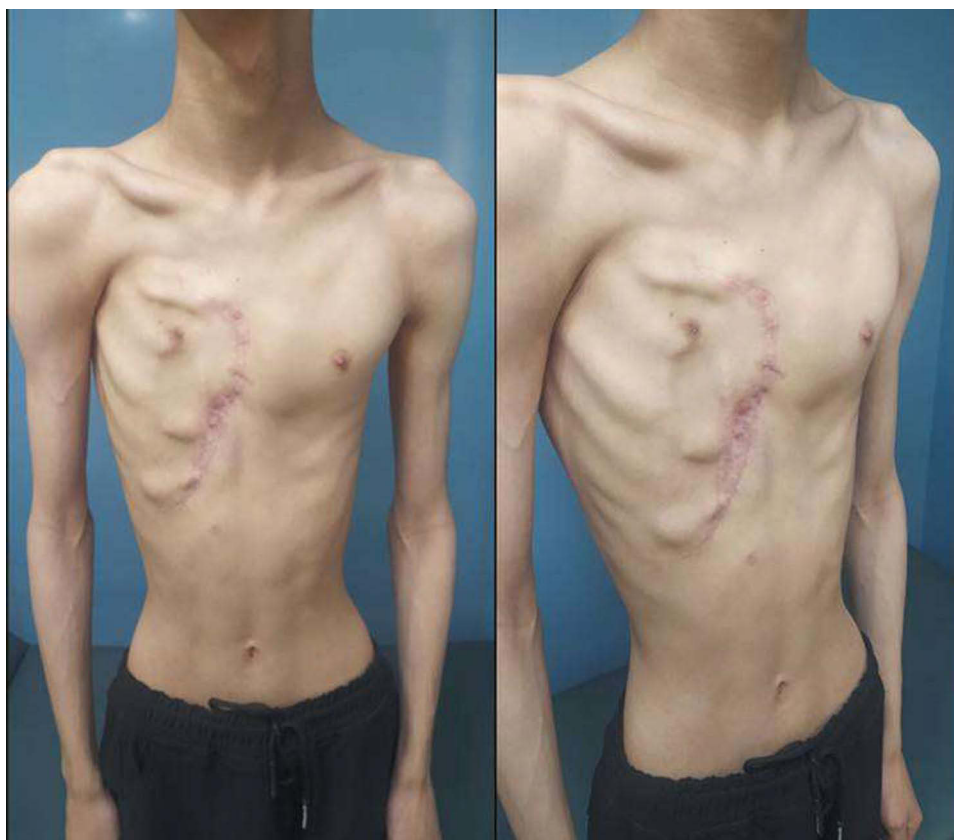
Figure 5 Patient's appearance 6 months after operation.