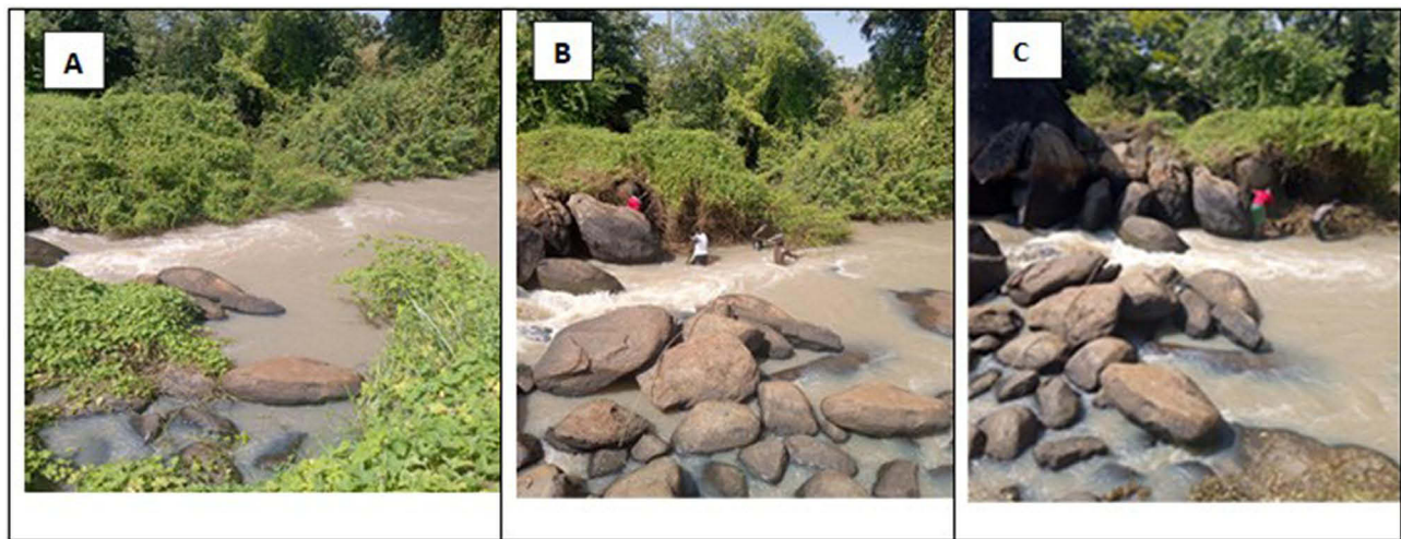
Figure 3 Slash and clear at Dogoyabolu site along the river Naam (A) before slash and clear (B) during slash and clear (C) after slash and clear implementation.

prospections, the field team could not detect any young stages on the rocks probably because of the high-water level that had covered most of them. It was only in Domelara site where the exposed rock was seen coated with algae and no larvae or pupae was collected from this site. This kind of scenario was reported in Maridi 14 and Victoria Nile focus in central Uganda. 25 Algae is known to reduce the amount of oxygen and makes the site unfavorable for S. damnosum breeding.