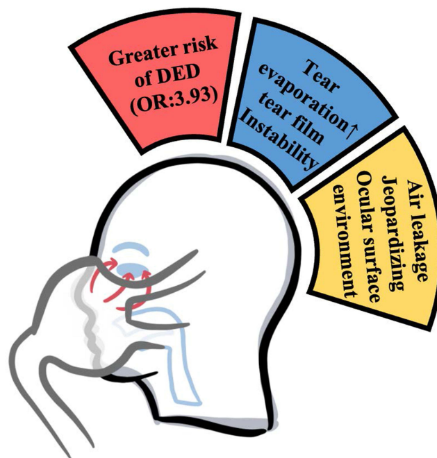
Figure 3 Summary of hypotheses in this study.

This study has several limitations. The definition of dry eye does not fully align with the latest DEWS or JDES criteria. Additionally, due to a lack of data on Ocular Surface Disease Index or Dry eye-related quality-of-life scores, we have limited our patient recruitment to those with documented positive eye irritation or discomfort. Data were obtained from the PSG database of the sleep disease center, and the findings may thus not be generalizable to the general population. The patients included in this study all had sleeping disorders. Due to the retrospective nature of this study, we were not able to standardize the duration of CPAP treatment, and adherence could not be assessed. However, our findings reveal a link between DED and OSA, underscoring the significance of understanding the impact of CPAP on ocular surface health. This emphasizes the importance of awareness and caution in the use of CPAP in such patients. Further large-scale prospective studies are warranted to better understand DED and potential treatment targets.