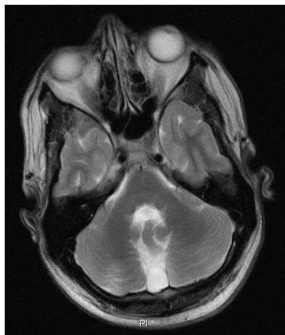
Figure 2 Transversal T2-weighted magnetic resonance imaging of the brain of Patient 1, showing hypoplasia of the cerebellar vermis.

Psychiatric examination disclosed symptoms of a severe major depression with irritability, loss of initiative, and marked sleep disturbances. Magnetic resonance imaging (MRI) of the brain showed hypoplasia of the cerebellar vermis with enlarged cisterna magna, and mild enlargement of the lateral ventricles (Figure 2). Neuropsychological assessment revealed severe ID (Vineland screener: 2 years 4 months) with marked deficits in expressive and receptive language. His cognitive profile was dominated by disordered attention and executive functioning, specifically expressed in hardly unintermittable perseverative behaviors. Citalopram was reintroduced in an increasing dose of 40 mg daily, but in the absence of effect was replaced 3 months later by nortriptyline (50 mg daily; plasma concentration 176 µg/L). Subsequent CYP2D6 genotyping revealed a polymorphism (*4/*41; intermediate metabolism) and, based on the plasma concentration, the daily dose of nortriptyline was fixed at 40 mg daily (plasma concentration: 96 µg/L). Valproic acid was continued at a stable dose of 1200 mg per day (plasma concentration: 58 mg/L). A definite diagnosis of atypical bipolar disorder was made (International Classification of Diseases-10; F.31.9). Follow-up during a period of 5 years showed that his mood and behavior clearly stabilized.