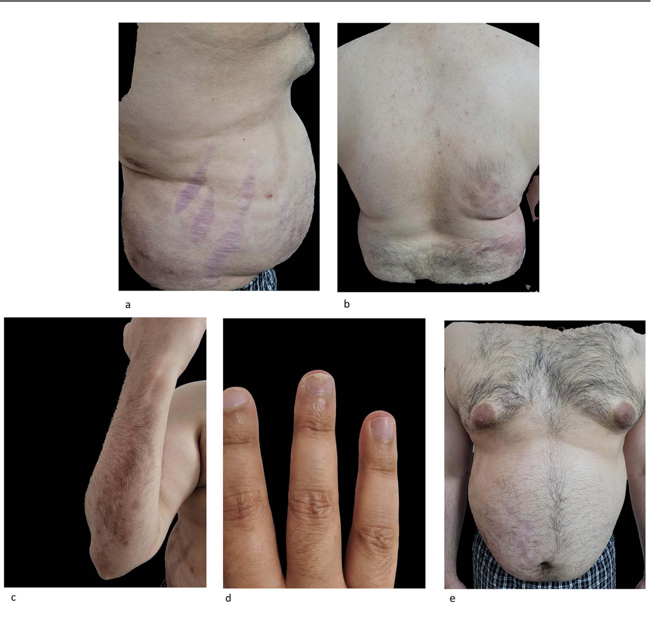
Figure 4 Full body and close-up images of the patient under treatment with lxekizumab. (a, b) Posterior view and right side of the patient showing discrete postinflammatory hyperpigmentation, (c) right forearm of the patient showing discrete postinflammatory hyperpigmentation, (d) close up image of the right hand showing discrete oil-drop sign on nail, (e) frontal view of the patient without signs of psoriasis.