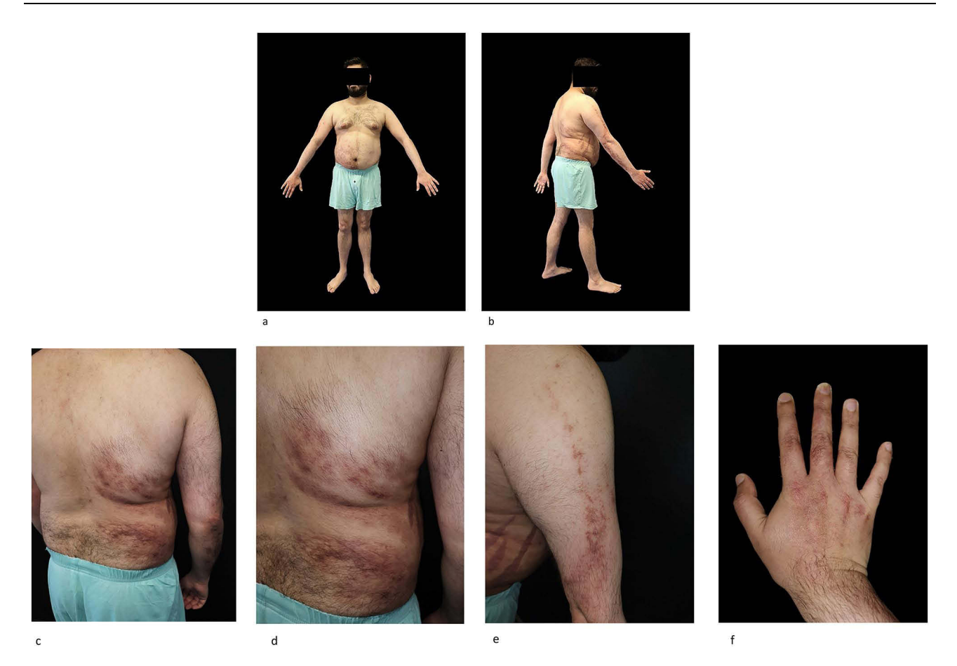
Figure 3 Full body and close-up images of the patient 16 weeks after initial treatment with lxekizumab. (a) Frontal view of the patient after treatment showing postinflammatory hyperpigmentation, (b) right side of the patient after treatment showing postinflammatory hyperpigmentation, (c-e) close up images of the right side trunk and arm of the patient, (f) right hand of the patient.

The patient was last seen in April 2024 and reported satisfaction with the therapy. The DLQI was 1. Only residual erythema without infiltration was seen. The pictures of the patient can be seen in Figure 4.