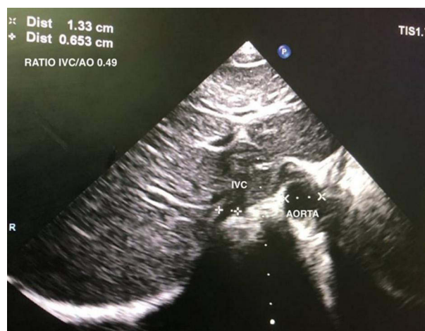
Figure 1 Ultrasound examination of IVC/Ao ratio.

The median age was 12 years (min of 5 to max of 17), with 62.5% (N = 30) being male, and malnutrition affected half of children (50%, N = 24). The blood pressure distribution was uniform, with equal percentages of hypotension, normotension, and hypertension, each at 33.3% (N = 16). The mean hemoglobin was 9.7 g/dL (SD of 2.3), and the median